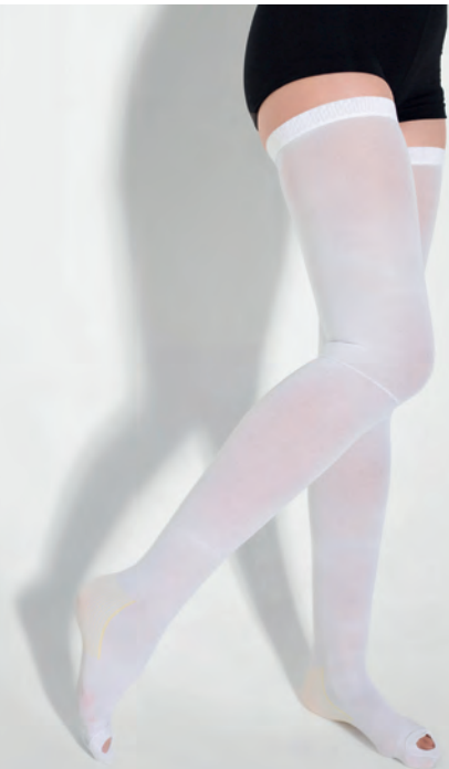
UPPER INSPECTION HOLE