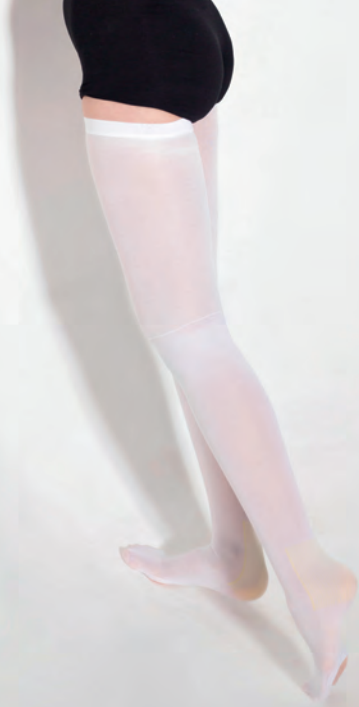
LOWER INSPECTION HOLE