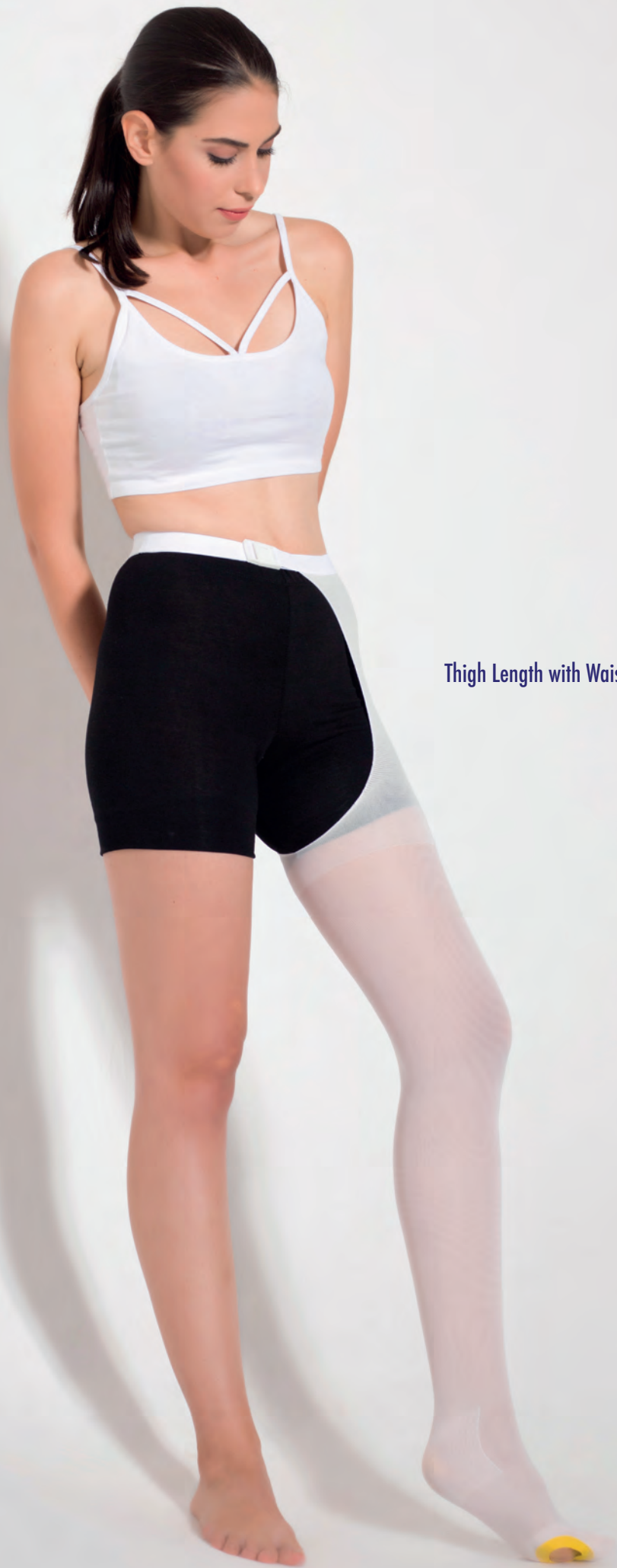
Thigh Length with Waist Belt